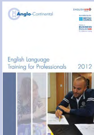
Professional Training Prospectus