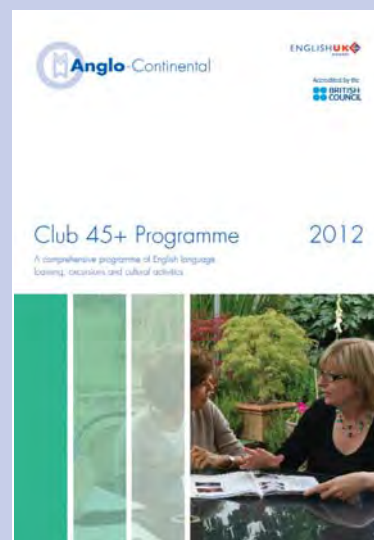
Club 45+ Programme