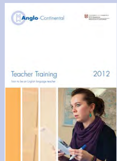
Teacher Training Prospectus