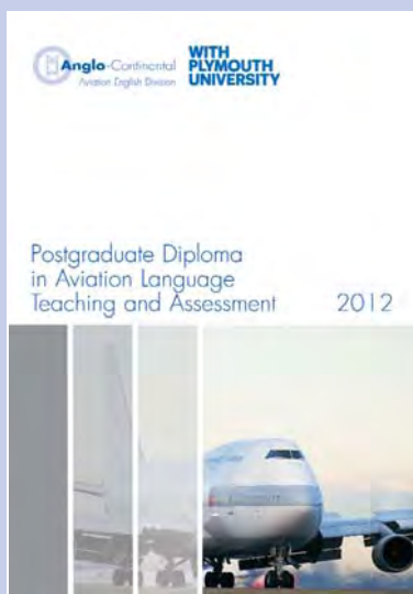
To be introduced in 2012 Postgraduate Diploma in Aviation Language Teaching and Assessment

Member of BUSINESS ENGLISH UK for Professional Training